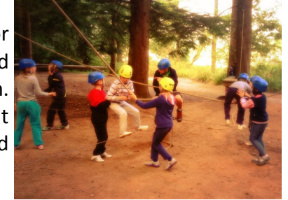
Caring for All, Committed to Excellence

independence, thinking for themselves and working as a team. All of these will put them in good stead for the year ahead.