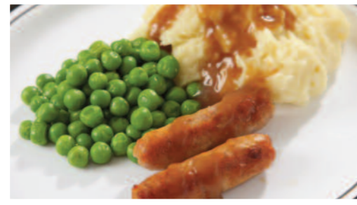
Sausages served with Mashed Potato, Seasonal Vegetables & Gravy