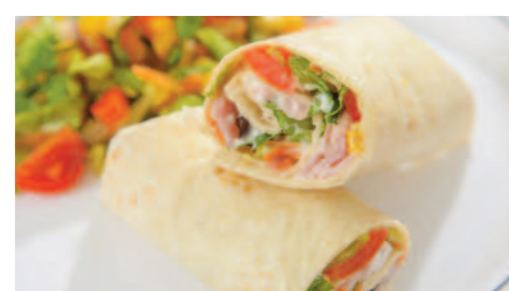
Deli Choice of Breads with a Selection of Fillings served with a Side Salad