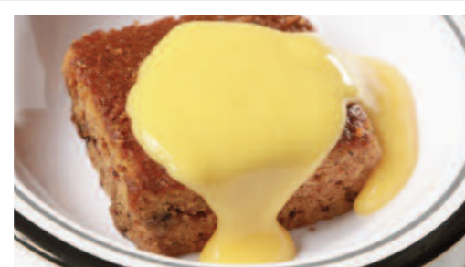
Sticky Toffee Pudding served with Custard