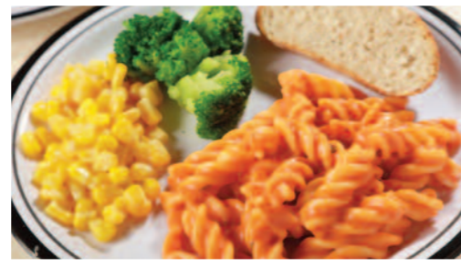
Tomato & Mascarpone Cheese Pasta served with Garlic & Herb Bread and Seasonal Vegetables