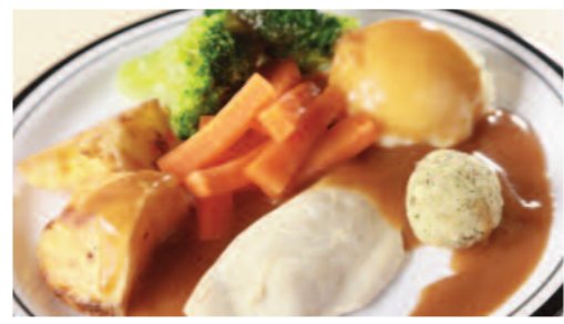
Roast Chicken served with Roast/Mashed Potatoes, Seasonal Vegetables & Gravy