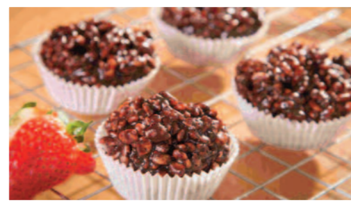
Chocolate Crispy Cake