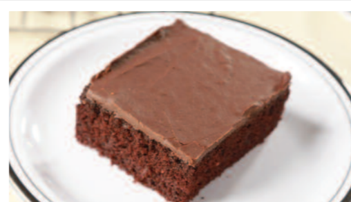
Iced Wacky Chocolate Cake