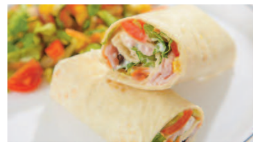
Deli Choice of Breads with a Selection of Fillings served with a Side Salad