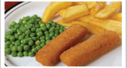
Fish Fingers served with Chips & Peas or Baked Beans

VEGETARIAN VERSIONS OF THE ABOVE MEAL AVAILABLE DAILY