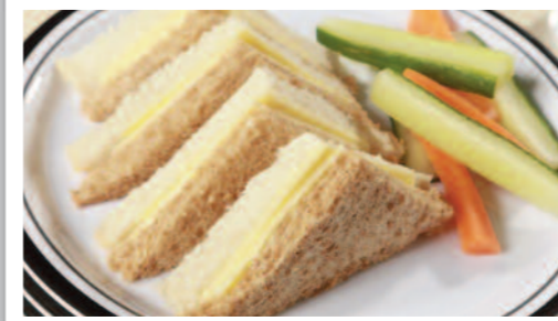
Deli Choice of Breads with a Selection of Fillings served with a Side Salad