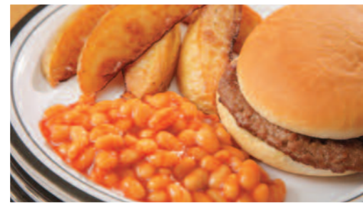
Beef Burger served in a Bun with Potato Wedges & Seasonal Vegetables or Baked Beans