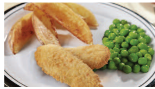
Breaded Chicken Goujons served with Potato Wedges & Seasonal Vegetables