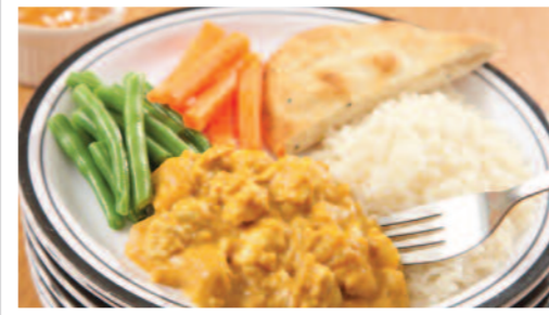
Chicken Korma served with Rice, Naan Bread & Seasonal Vegetables