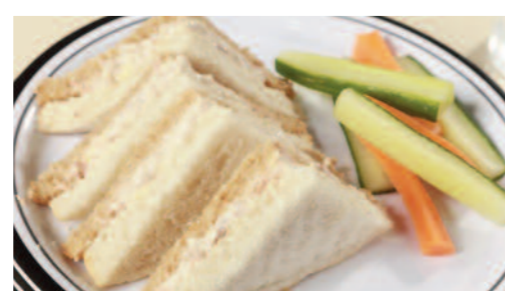
Deli Choice of Breads with a Selection of Fillings served with a Side Salad