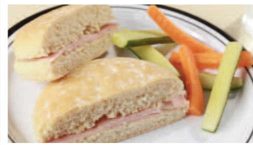
Deli Choice of Breads with a Selection of Fillings served with a Side Salad