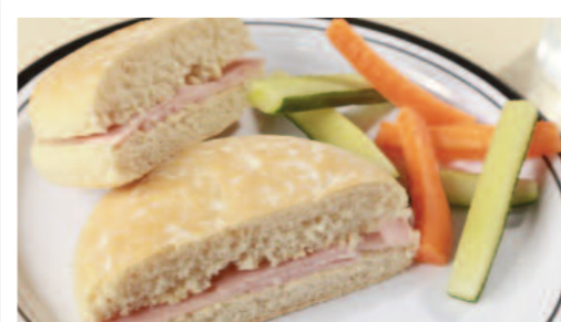
Deli Choice of Breads with a Selection of Fillings served with a Side Salad