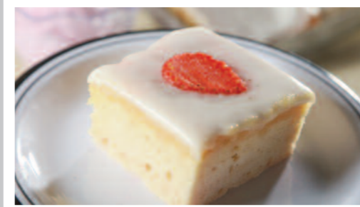
Strawberry Ice Cream Cake