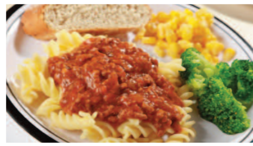
Pasta Bolognese served with Garlic & Herb Bread and Seasonal Vegetables