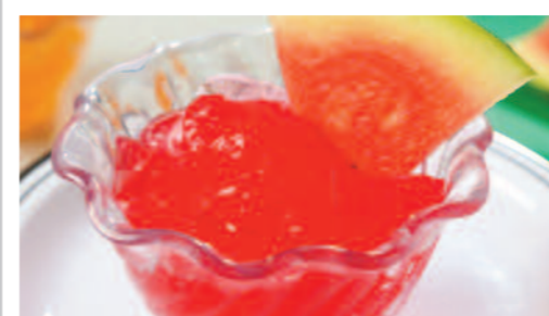
Jelly & Fruit