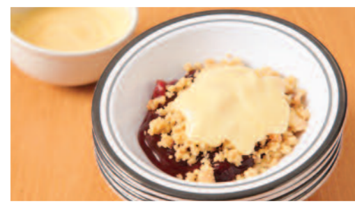
Fruit Crumble & Custard