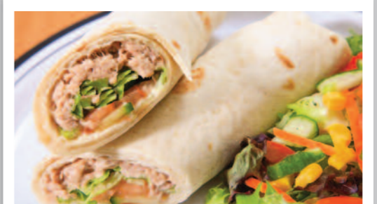
Deli Choice of Breads with a Selection of Fillings served with a Side Salad