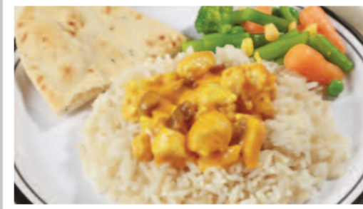
Fruity Chicken Curry served with Rice, Naan Bread & Seasonal Vegetables