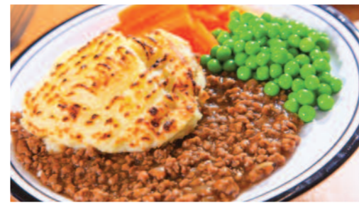
Cottage Pie served with Seasonal Vegetables