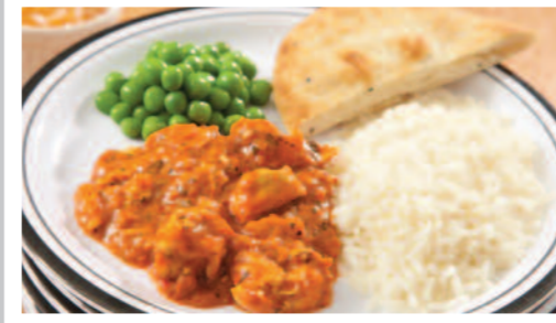
Chicken Tikka Masala served with Rice, Naan Bread & Seasonal Vegetables