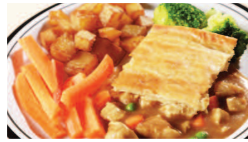
Homemade Chicken Pie served with Diced Crispy Potatoes & Seasonal Vegetables