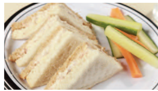
Deli Choice of Breads with a Selection of Fillings served with a Side Salad