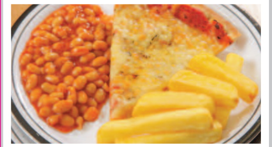
Cheese & Tomato Pizza served with Chips & Peas or Baked Beans

VEGETARIAN VERSIONS OF THE ABOVE MEAL AVAILABLE DAILY