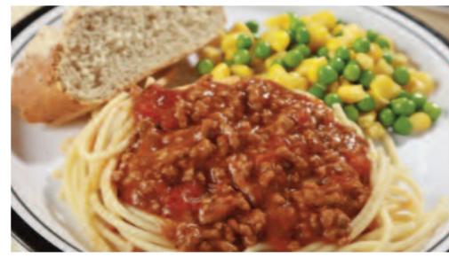
Spaghetti Bolognese served with Garlic & Herb Bread and Seasonal Vegetables