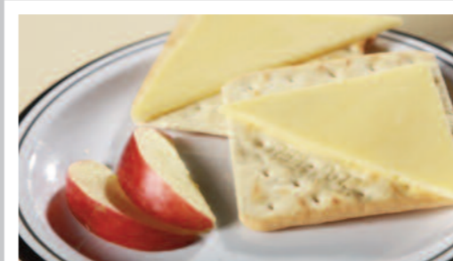
Cheese & Crackers