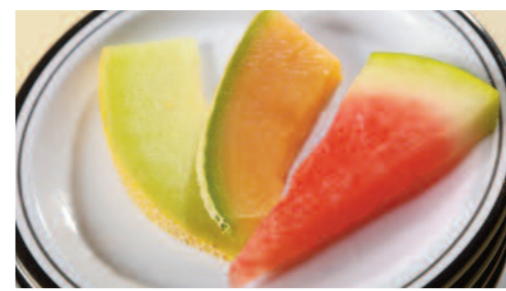
Trio of Melon