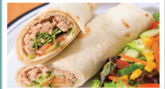
Deli Choice of Breads with a Selection of Fillings served with a Side Salad